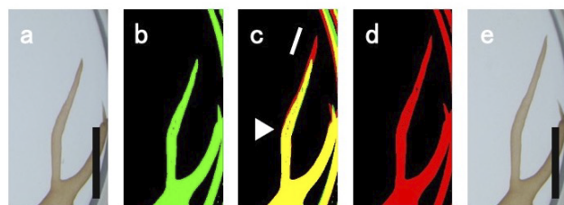
Fig. 1. Photographs of growing front edges of algal thalli. (a) Control branching pattern of red alga. (b) Binarized image of (a). (c) Merged data. The arrow head represents the bended structure of thalli. The white bar represents the difference in the length. (d) Binarized image of (e). (e) One day after branching pattern of red alga. Scale bars represent 2.5 mm.

To develop an isolation method for the mutant line, we applied a heavy-ion-beam irradiation system to A. subulate . The microplantlets were replaced into 15 mL conical tubes with fresh 2 mL of culture medium at each irra-