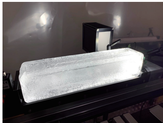
Fig. 2. Photo showing an ice block after the continuous extraction of 100 meltwater samples in a stability test.

environment, we performed a continuous sampling test in which 100 vials were filled with a minimal volume (0.65 mL) of meltwater. In this test, the laser power was set at 1.9 W, the nozzle intrusion speed was 0.52 mm/s, the pumping speed was 5.5 mL/min, and the horizontal and vertical pitch of the nozzle was 2.5 mm. It took 8 hours 47 minutes to complete this test with no issues the \sim -20^\circ\text{C} environment. Figure 2 shows a dummy ice block made up from ultrapure water (Milli-Q water) after this stability test. We conclude that the sampling rate will not be a bottleneck during high-throughput isotopic and ionic ice-core analyses.