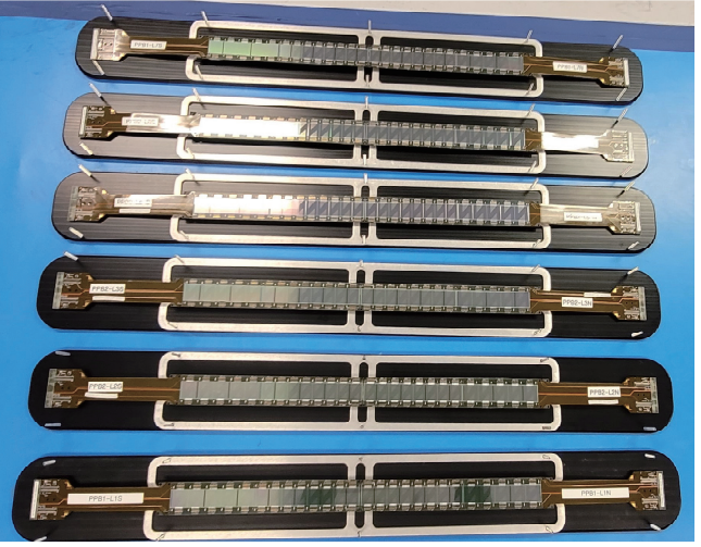
Fig. 2. Fully assembled INTT preproduction ladders.