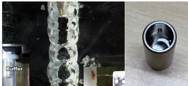
Fig. 2. Left figure shows a photo of melting ice with the nozzle intruding the dummy ice (bottom right) and the inside buffer being filled (bottom left). The right shows a filled vial.

In Fig. 1, the laser beam delivered by the optical fiber irradiates the target ice-core surface, and 1.5 mL of melted water (sufficient volume for our precision analysis) is sucked up through the nozzle and transported into our original SUS vial bottle by a peristaltic tube pump at a pressure drop of 1 atm. The nozzle and tube are kept above 0°C by the heaters installed inside the nozzle assembly.