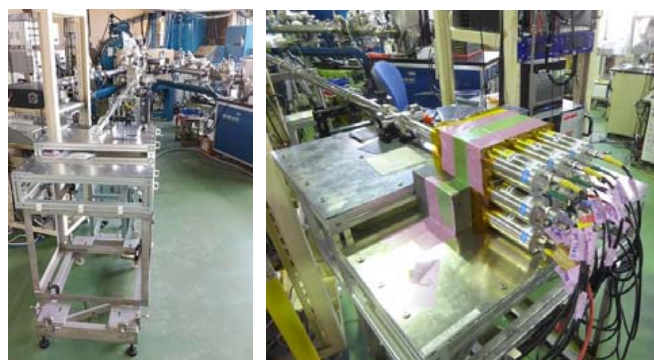
Fig. 2. BL-W15 started to be used again as a multipurpose beam line after the renewal of the beam diagnostic system. The degree of vacuum level for the user setup is required to be better than 10 -4 Pa. (Left). A setup for calibration of gamma ray detectors using a resonance reaction with a carbon target bombarded by 1 or 2 MeV proton beams (Right).